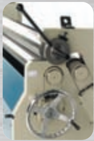
Easy material removal

Ph. (916) 638-7718 Fx. (916) 638-2450 Email: sales@scottmachinery.com 4700 Lang Avenue, Suite D McClellan, CA 95652