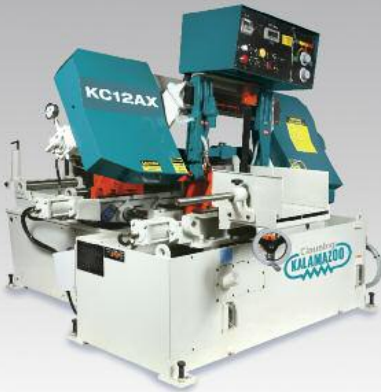
Shown with optional Hydraulic Bundle Clamp and Variable Vise Pressure System