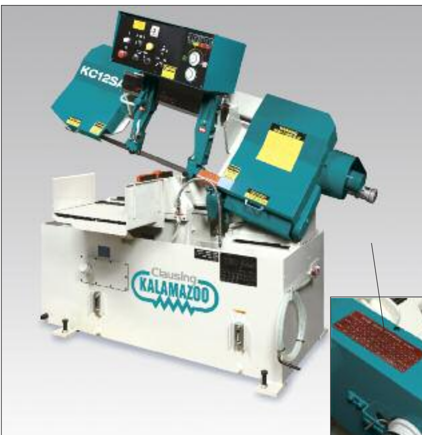
Speed control and speed chart on variable speed model KC12SA