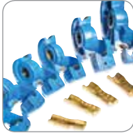
Tube & Pipe Tooling Kits