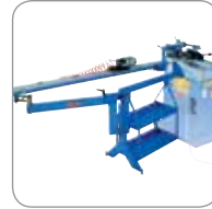
Two Axis Positioner