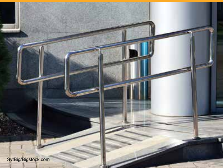
◀ Ercolina Bending Application