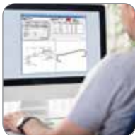
Easy Part Layout Software