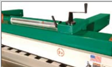
Model MSE1016 shown with 2x back gauge