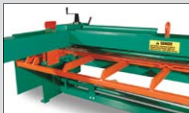
Mode MSE1016-F shown from rear. (Sheet Support System-F)

Numerous options are available. Please consult a TENNSMITH sales representative for specific details.