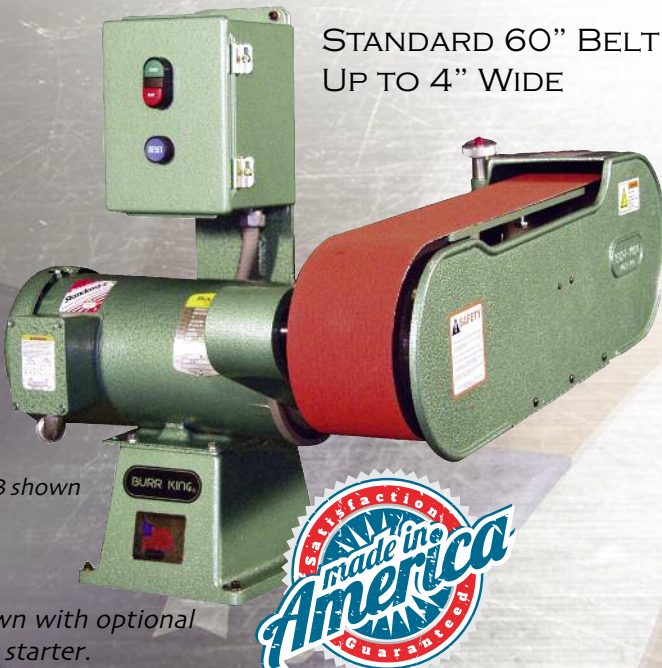
Shown with optional mag starter.