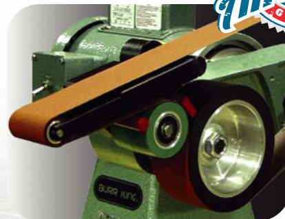
965 Small Wheel Attachment for 2" wide belts. Diameters included 9/16", 3/4", 1", 1.5", 9/16" - 1.5"

CAUTION: The Model 960-272 belt grinder is designed by use by persons who require full access to most portions of the belt path. As such users of the 960-272 must exercise caution when using the machine to avoid entanglement in rotating parts, entrapment in pinch points, being struck by grinding debris, being struck by ejected work pieces and other hazards that are associated with power driven rotating equipment. Failure to properly use the machine, follow operating instructions, and good safety practices may lead to serious personal injury, death or property damage. Not for industrial applications. If you require a machine designed for industrial applications please see the Model 960 on page 6.