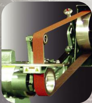
944 Vertical Platen Attachment with optional workrest.

Make your Burr King a finishing center. Run buffs, woven and convolute polishing wheels simply by using one of our versatile adapters.