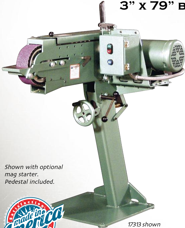
Shown with optional mag starter. Pedestal included.