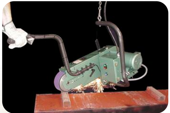
Model 979 adapts as a swing grinder.